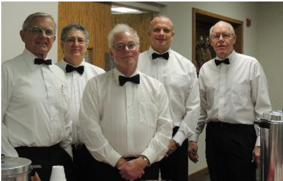
Figure 2 Christmas Tea, 2014

He has a heart for the youth and the elderly. Everyone is invited to join us for the opening devotion, entertainment and a marvelous offering of cookies, pastries, punch, coffee and tea. A sign up list will be at the welcome center soon...the men of the congregation will want to sign up early to be servers again this year!