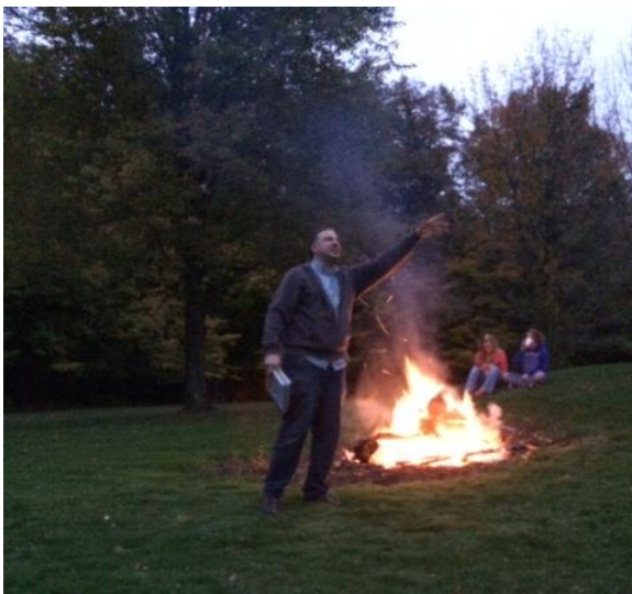
Figure 1 Memories from last year's bonfire.